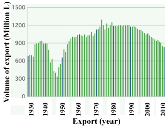
Fig. 4.5 Export volume of soy sauce.

(Report from Shoyu Information Center, Japan Shoyu Association. 2012.)