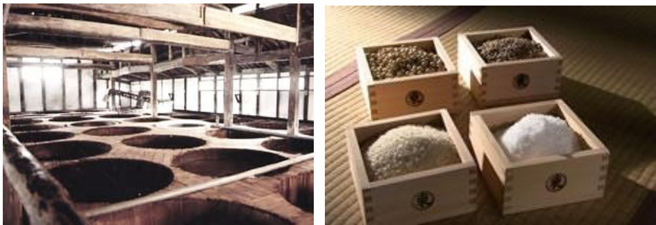
Fig. 4.2 Traditional soy sauce brewing.

Japanese traditional soy sauce is produced in wooden tanks by static fermentation for 1 to 2 years (Fig. 4.2). Moistened soybeans are cooked at high pressure and high temperature, while wheat is roasted and ground. Then almost the same amounts, by weight, of soybeans and wheat are mixed with a small amount of seed koji mold. The mash, which contains koji , salt (15~17%) and water, is called moromi , and is fermented in large enamel or stainless tanks for 6 to 8 months at room temperature or higher. Several kinds of koji mold are used for fermentation, and one of them is Aspergillus oryzae , which is also used for brewing Japanese sake , and the other one is Aspergillus sojae , which is tolerant against salt. Sojae was named so, because the mold was separated from soy sauce. Fermentation is assisted by the propagation of lactic acid bacteria and yeasts which are also tolerant against salt. Finally, the aged moromi is pressed and the liquid exudate is pasteurized to yield soy sauce.