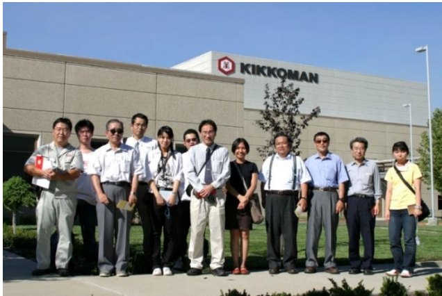
Fig. 4.6 Visitors at a soy sauce factory in Sacramento, CA, USA.