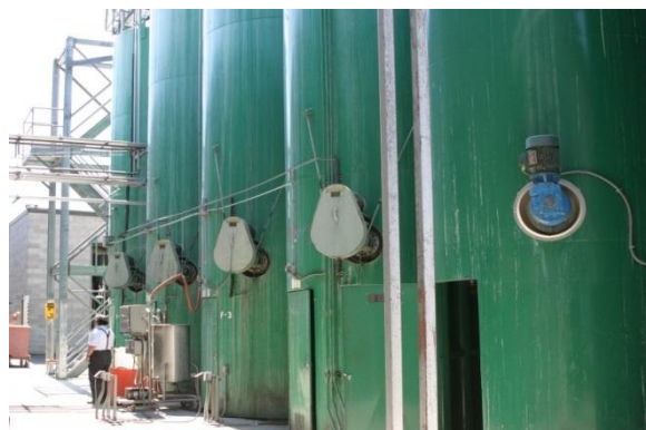
Fig. 4.4 Aging of soy sauce production in modern factory.

Nowadays, a great deal of good soy sauce, rice vinegar and Japanese sake are produced in modern computer-controlled systems, from the cooking of raw materials to bottling (Fig. 3.6; Fig. 4.4.).